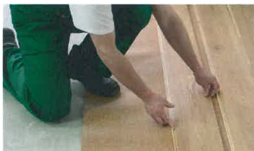
Fig. 3. The view of 3-layer wooden floorboard produced by Barlinek Inwestycje Sp. z o.o. during installation

The Barlinek floorboard can be installed in a floating system, that is glueless and based on modern tongue-and-groove joints. It is a method, that allows to install the floor yourself. The floor is also easy to be dismantled or re-installed. An alternative is to install the floor in a traditional way - by gluing the boards to the subfloor, which ensures stability of the installation even on large surfaces. The Barlinek floorboard does not require any additional preservative treatment. The floor is ready for use immediately after installation. The performance of the product is listed in Table 2.