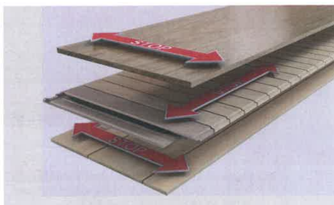
Fig. 1. Cross structure of 3-layer wooden floorboard produced by Barlinek Inwestycje Sp. z o.o.

Barlinek floorboard is made from three layers of real wood arranged in a cross structure (Fig. 1) in order to prevent swelling, squeaking or drying out causing splits. The cross construction reduces natural tension and compression of wood, provides a balance between the layers of the board, and thus guarantees the stability of the floor. The Barlinek floorboard's layered structure is suited for underfloor heating. The floorboards are joined using 5Gc joints and Barclick (Fig. 2) which allow to lay the floor without most of the tools which are usually necessary to install a floor. Specification of the product is shown in Table 1.