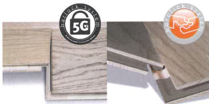
Fig. 2. Views of Barlinek floorboards with 5Gc BARLOCK and BARCLIK systems